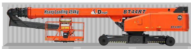
Standard Container Transport