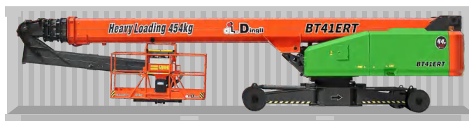
Standard Container Transport