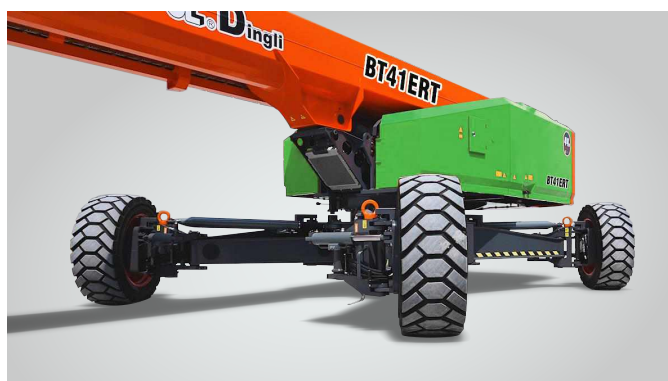
Brand New One-Key In-Situ Axle Expansion Technology Global Patent Protection